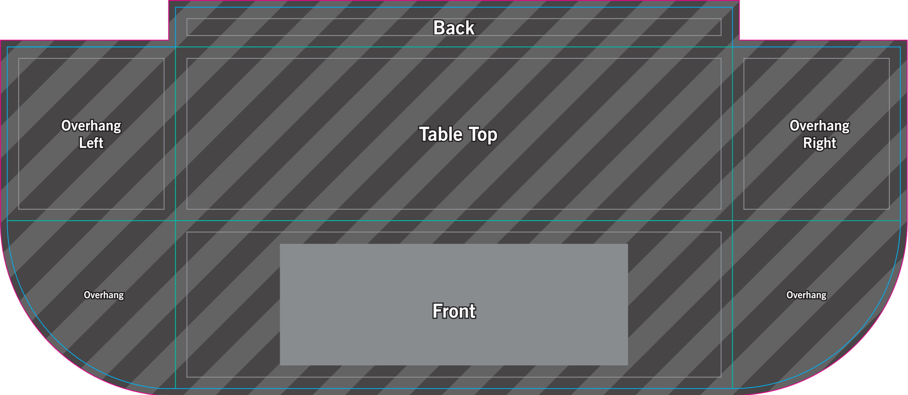
Design in Front Box Only