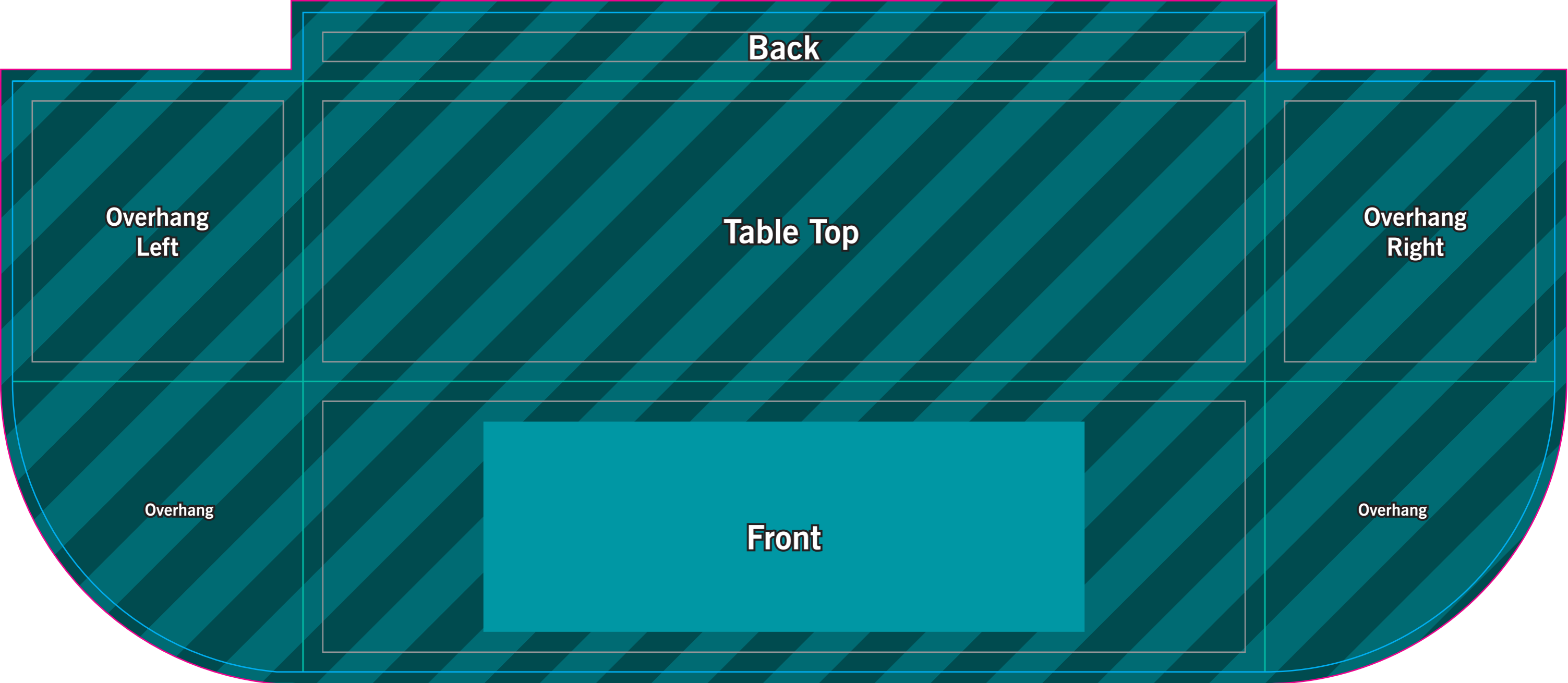
Design in Front Box Only