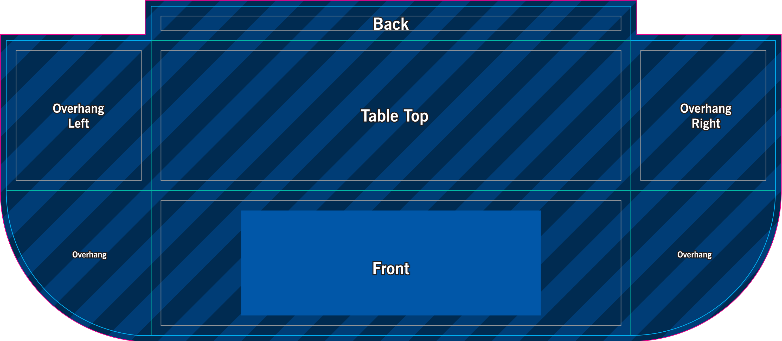
Design in Front Box Only